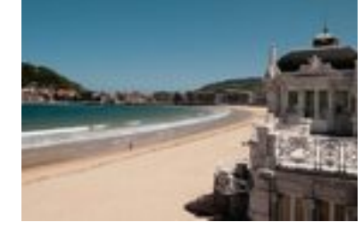
This is the greatest place on earth