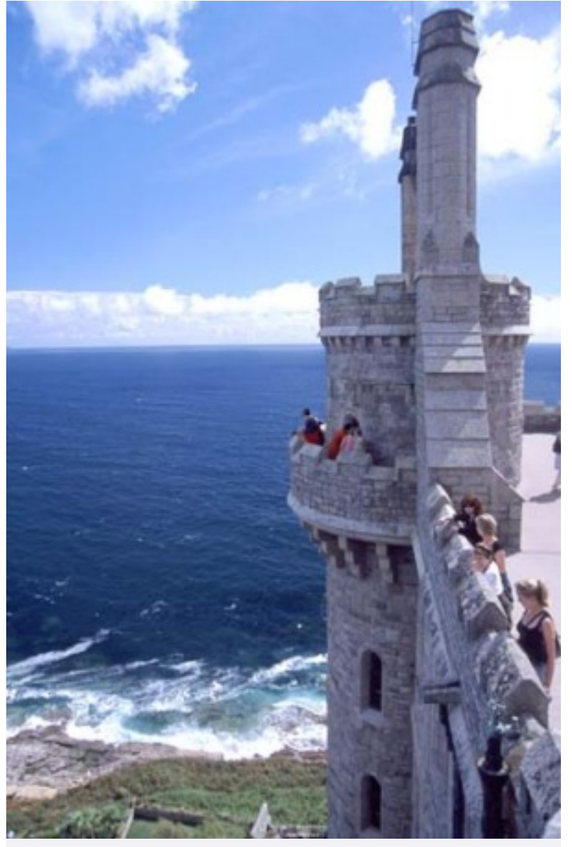
The castle on St Michaels Mount.

My first stop is the Island Cafe, where the till has broken down and a woman is calmly serving a long line of people wanting lunch. All the staff on the island are extremely friendly and helpful, and I notice the guides doing their best to answer all