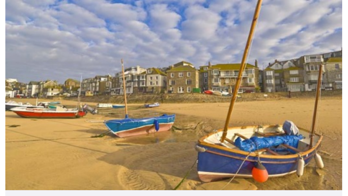
Sands of ages: Boats await the tide at St Ives.

St Michaels Way is thought to date as far back as 10,000BC and at the hamlet of Ninnes Bridge there are three large standing stones beside the path indicating it is a pre-Christian route.