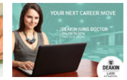
Deakin Juris Doctor online in 2016